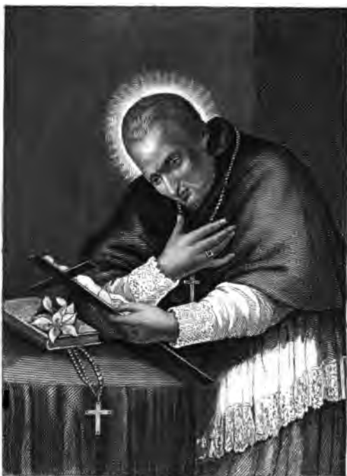
ST. ALPHONSUS MARIA DE LIGUORI, BISHOP AND CONFESSOR. Born 27 th Sept r 1696 Died 1 st August 1787. CANONIZED BY POPE GREGORY XVI, MAY 26 th 1839